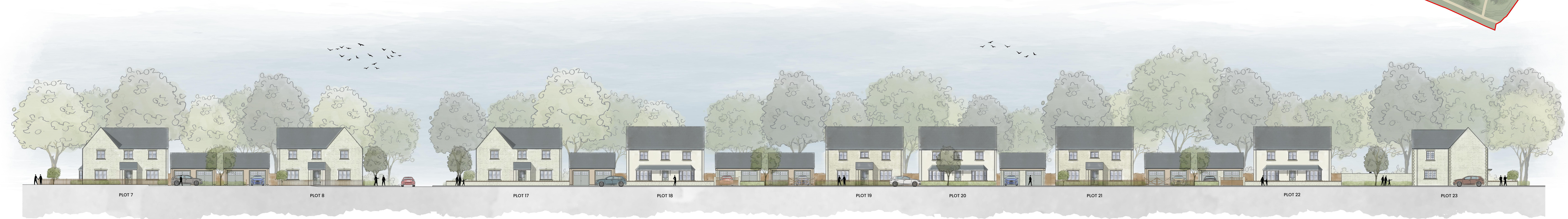
ILLUSTRATIVE STREETSCENE D-D