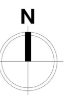
KEY PLAN - NTS