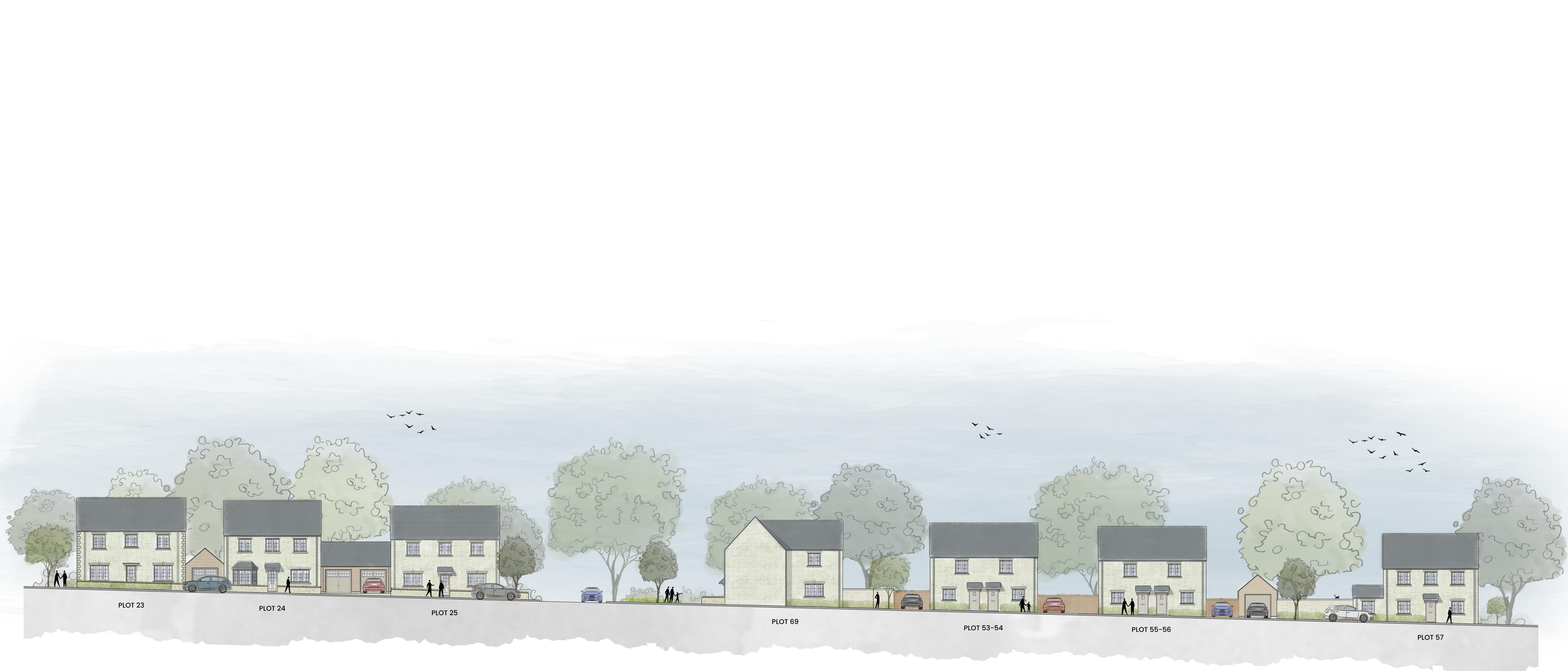
ILLUSTRATIVE STREETSCENE C-C